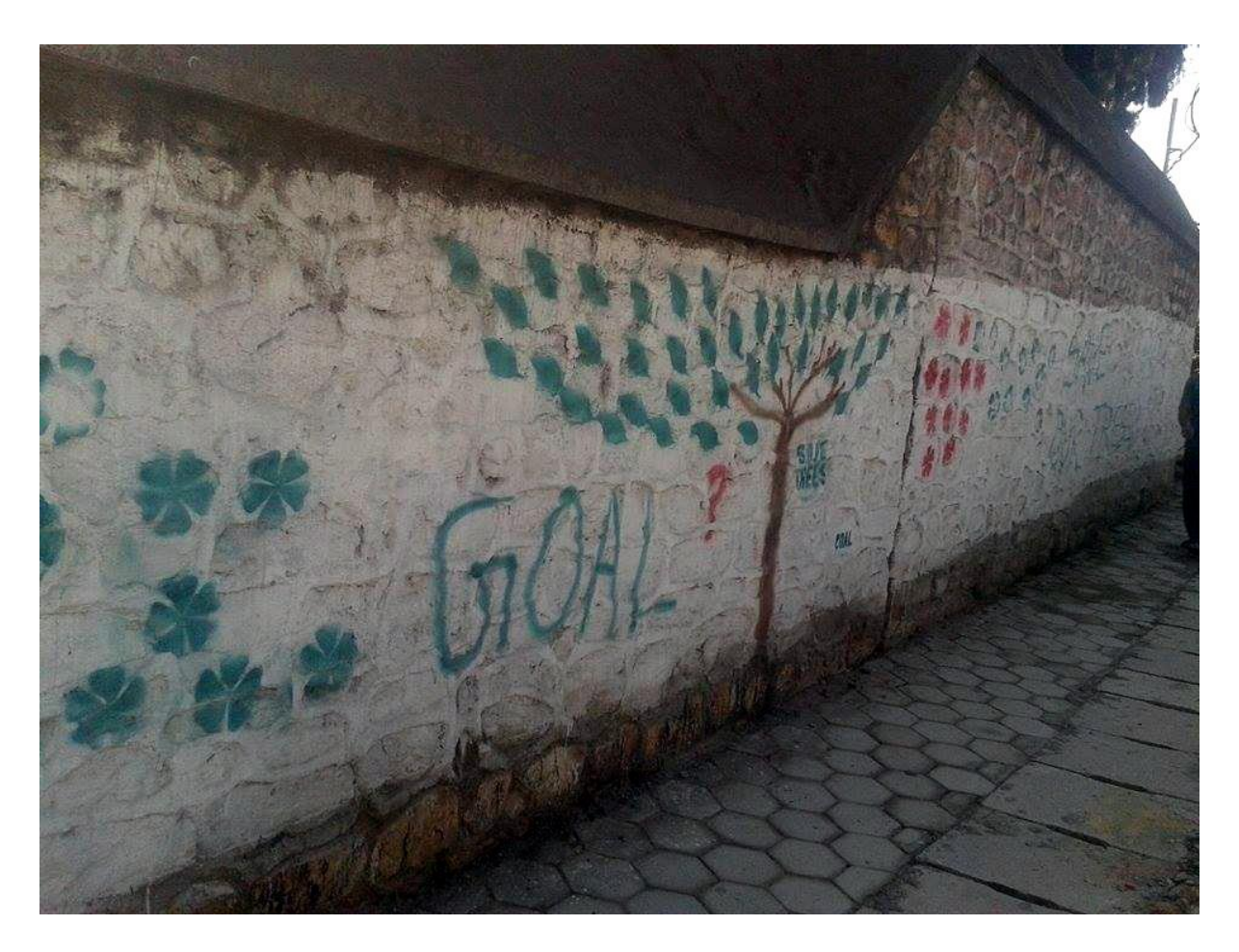
3. Increasing deforestation has negative impacts on human beings as well as the climate. This painting was done to raise awareness about the need for deforestation control.