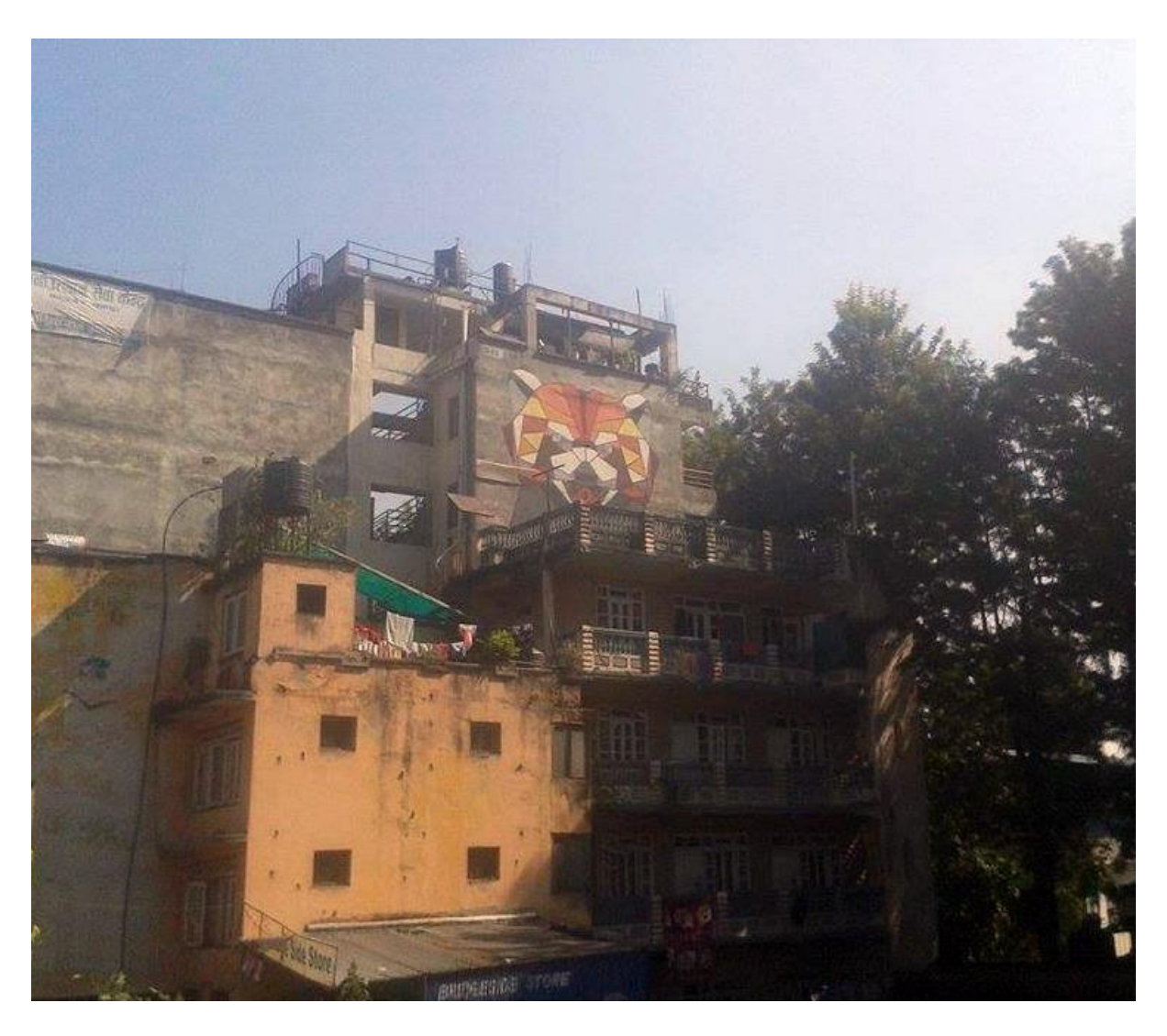
11. As seen on the top floors of a building, this art features a fox made of polygons. And yes, it's symmetrical too.